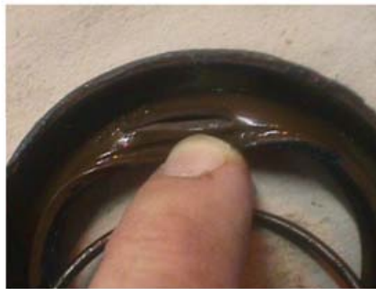
Wiggling a motor while mounting it to a gearbox can cause permanent seal damage.