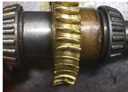
Chemicals found in many lubricants with EP (Extra Pressure) additives will soften the bronze worm gears and lead to rapid wear of the gear tooth structure.

Many gearboxes can also benefit from the use of double seals, especially a gearbox mounted with input low (Worm-Under). Some manufacturers recommend against mounting in the worm under configuration. Others find that doubling up on seals will ensure unit integrity. Checking with the manufacturer is recommended.